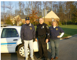
Six Goshen Officers assisted by twelve CPAAA members handed out candy to trick-or-treaters in various neighborhoods on October 31st.

"The Goshen Township Police Department is staffed with 11 full-time, 2 part-time, and 1 auxiliary police officer."