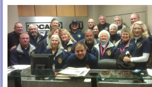
On October 19th, the CPAAA took a tour of Channel 12 News.